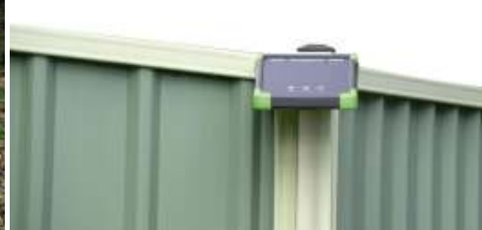
Steel Post Anti-Theft Mounting

You can mount the Energiser on top of most sizes of steel posts (Key #4 & #2). The Energiser's internal mounting bolt locks the Energiser to the post and is easily attached or removed using the supplied Key.