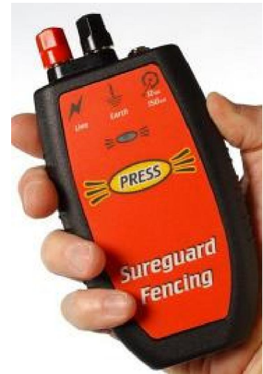
The Sureguard electric fence energizer will, according to the manufacturer, power two kilometers of electric fence continuously for several days, yet it weighs only about half a pound.

"You'd hear them huffing and stomping brush because they were