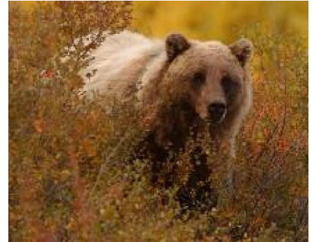
Curious bears that tear into tents, food and equipment can be a nuisance and danger to backcountry travelers. The use of electric fences to deter bears is becoming more practical as better, lightweight technologies are introduced.

"Down here, grizzly bears are an endangered species, so it's a whole different deal," he said. "Grizzlies are an endangered species. We are required (by government agencies) to do things to protect them."