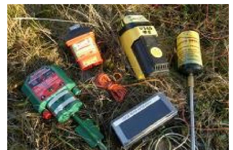
Battery-powered electric fence energizers can deliver bears a 6,000-volt charge if touched.