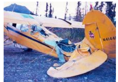
This Piper Cub plane was destroyed by a brown bear at Lake Clark.